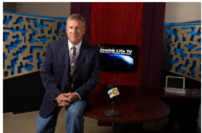
February 12, 1944 – August 25, 2020 18 Sevat 5704 – 5 Elul 5780